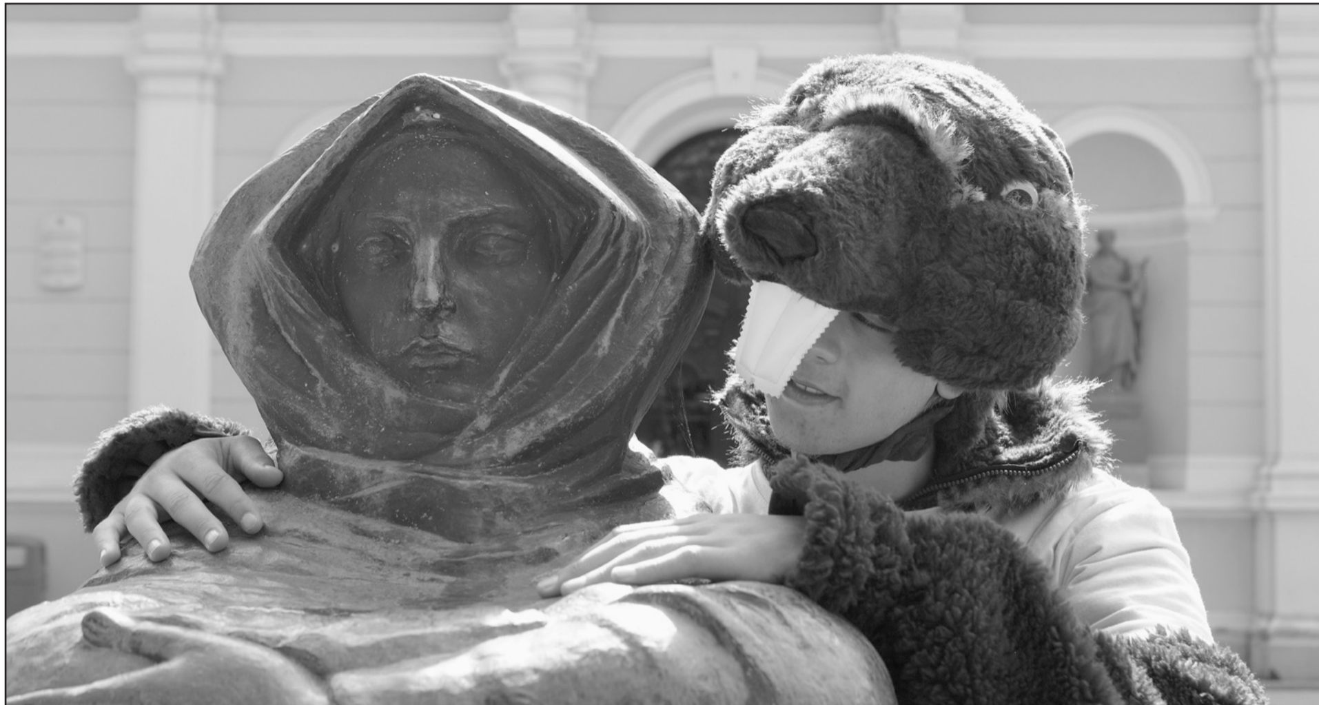
LOCATION 1: ZORIN DOM CITY THEATRE. To the general public - The first theatre in Karlovac is issuing an invite to attend cinematography projections in Zorin Dom.