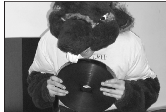
CORN OR FILM. While some beavers enjoy eating corn, Mr Beaver prefers the film reel.