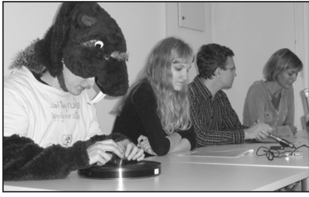
MR BEAVER IN ZAGREB. Having conquered the town and all the rivers around it, Mr Beaver set its course to our nations capital, where at a press conference, he made its imperialistic plans of capturing the hearts and thoughts of film fans all over the world, known to the public.