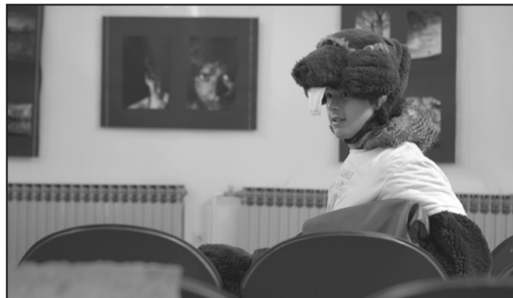
LOCATION 3: YOUTH LIBRARY. Just a few short steps away of the geometrical centre of Karlovac- the famous six pointed star, and in the centre of attention. All roads lead to the Youth library.

Many beavers dwell in the beautiful rivers around Karlovac, but only one of them wears a yellow T-shirt and is a great fan of movies. Following thorough preparations and a long period of nervous expectations, the yellow flood has reached Karlovac for the fourth time and splashed its shores with incredible films, a fact which our Mr Beaver used as a opportunity to continue his search for his better half- Ms Beaver. And while Ms Beaver is hiding her little self quite successfully in the impasses of Karlovac area, the film fever has spread itself throughout the city (without a cinema), enabling all of you filmfiles four days of top quality film programme.