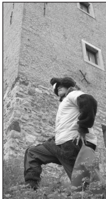
LOCATION 2: DUBOVAC. A safe distance away from the cities beaver fever, where the air is fresh and the landscape filled with oak., lies the old city of Dubovac which is after a few centuries of a peaceful existence, again under siege.

Many beavers dwell in the beautiful rivers around Karlovac, but only one of them wears a yellow T-shirt and is a great fan of movies. Following thorough preparations and a long period of nervous expectations, the yellow flood has reached Karlovac for the fourth time and splashed its shores with incredible films, a fact which our Mr Beaver used as a opportunity to continue his search for his better half- Ms Beaver. And while Ms Beaver is hiding her little self quite successfully in the impasses of Karlovac area, the film fever has spread itself throughout the city (without a cinema), enabling all of you filmfiles four days of top quality film programme.