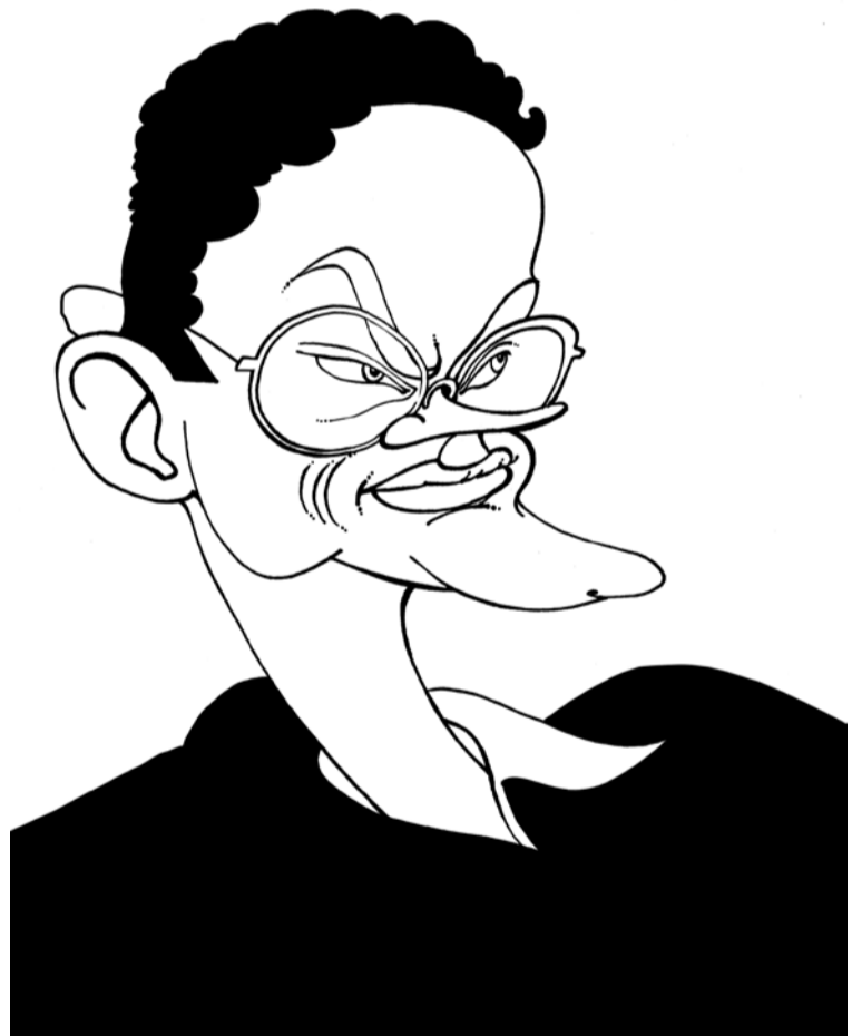
TALENTS. "I've seen a lot of films made by really talented directors and I have no doubt that one day their own names will have become synonyms for talented movie makers."